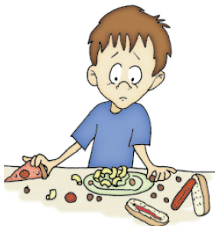
Severe self-limiting diet and/or food sensitivity